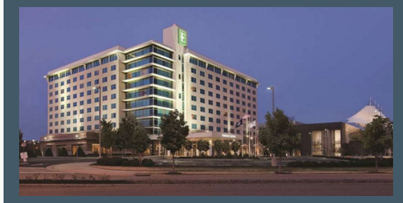
The ALPCA international convention will be at the Hampton Roads Convention Center July 20-23. The host hotel is the Embassy Suites located at 1700 Coliseum Drive, Hampton, VA 23666.